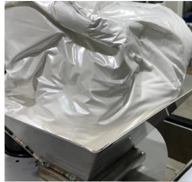
(Changing Times Closure – 6 or 14-gallon option)